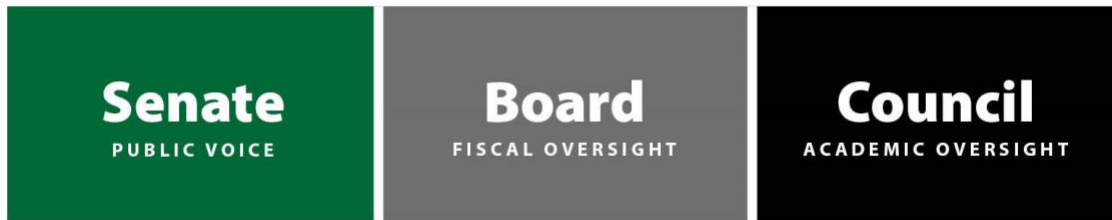
Figure 1. The Legislative Branch: a Tricameral Governance Model