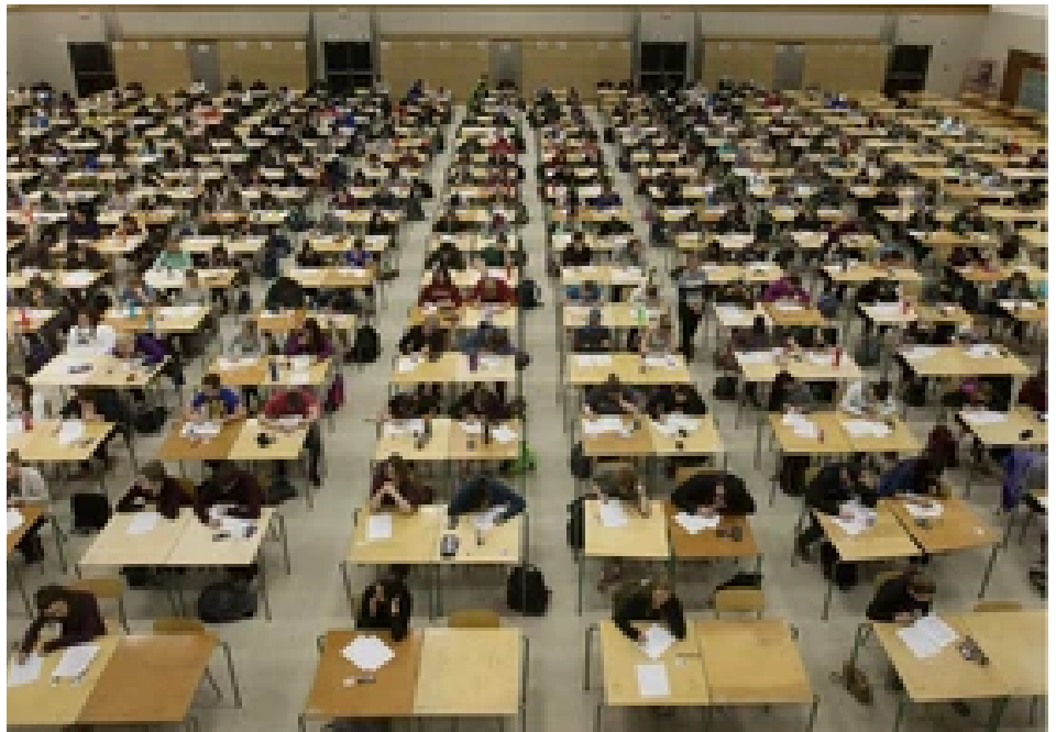
USask students writing exams in the Education Gym

Work continues on the revised Assessment Policy and the overhaul to the Academic Courses Policy. A progress update will be provided to APC in the late Spring.