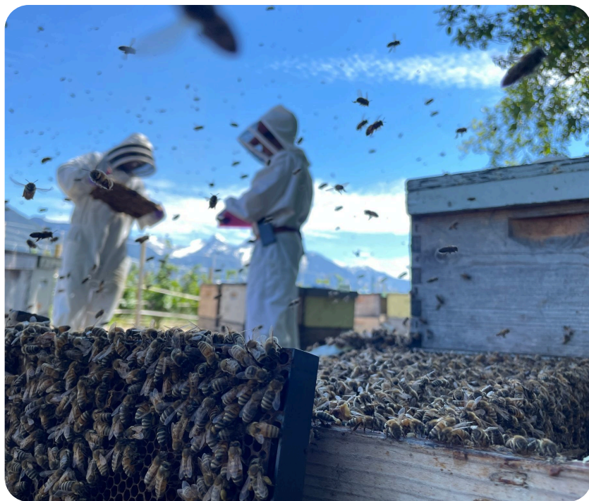
A Busy Day in a BC Bee Yard

The Research, Scholarly, and Artistic Work Committee has worked to engage with a number of units that support the research, scholarly and artistic mission of the university. The committee met with the Vice-Provost, Faculty Relations regarding changes to standards for promotion and tenure in December. The committee engaged with the Associate Vice-President, Research for annual reporting on breaches of the Responsible Conduct of Research Policy and discussed supports for researchers to conduct themselves with integrity.