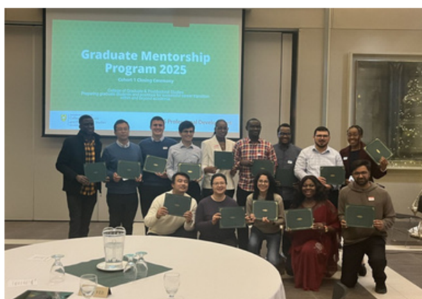
The Graduate Mentorship Program celebrated 19 successful students in the first cohort of the program

Graduate studies explored the edges at TEDxUniversityofSaskatchewan 2026 , with five graduate students taking the stage to deliver ground-breaking talks.