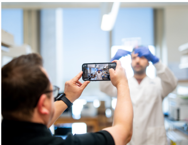
Graduate student researchers captured at the Sask Cancer Agency as part of the photoshoot for graduate recruitment efforts