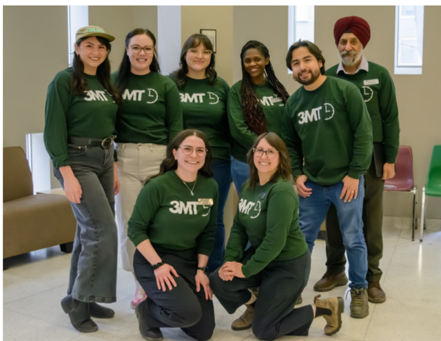
CGPS staff volunteer at the 2026 USask 3MT Finals