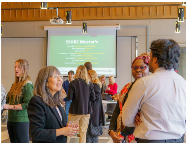
Students, supervisors, and other members of the USask community attend the annual Celebrating U event