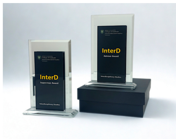
2025-26 marked the inaugural year of the InterD Supervisor Award and the InterD Advisor Award

The newly established InterD Publication Award provides financial support to InterD students for research publications in peer-reviewed journals that require publication fees.