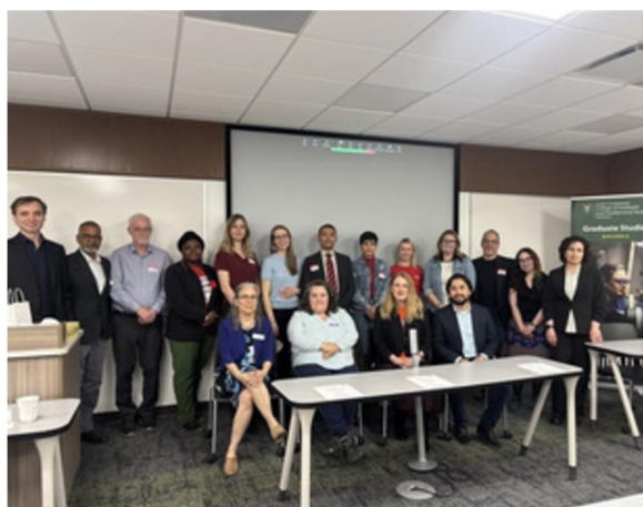
InterD students, supervisors and advisors attending the InterD Annual Symposium