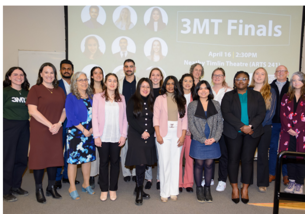
3MT 2026 finalists and judges